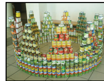
Contractors Institute 2010