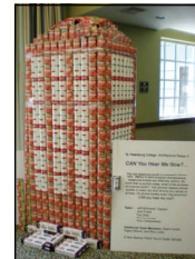
St Pete College - 2009