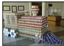
TVW Shelter Workshop & Phillip Lee, Architect 2010

Complete rules and regulations are included. Teams are responsible for acquiring canned food.