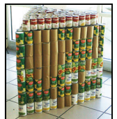
Spring Engineering and PHCC 2010