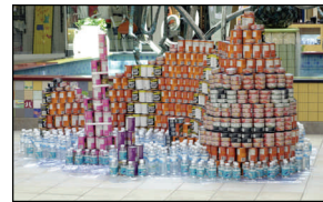
Schenkel Shultz - 2008