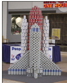
HKS Architects 2008

Enter today. Get creative and help stop hunger. ONE CAN