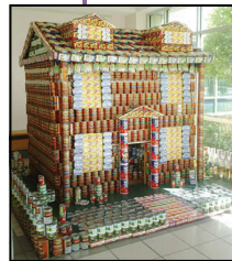
Clayton Design Group & Samuelsen Builders 2010